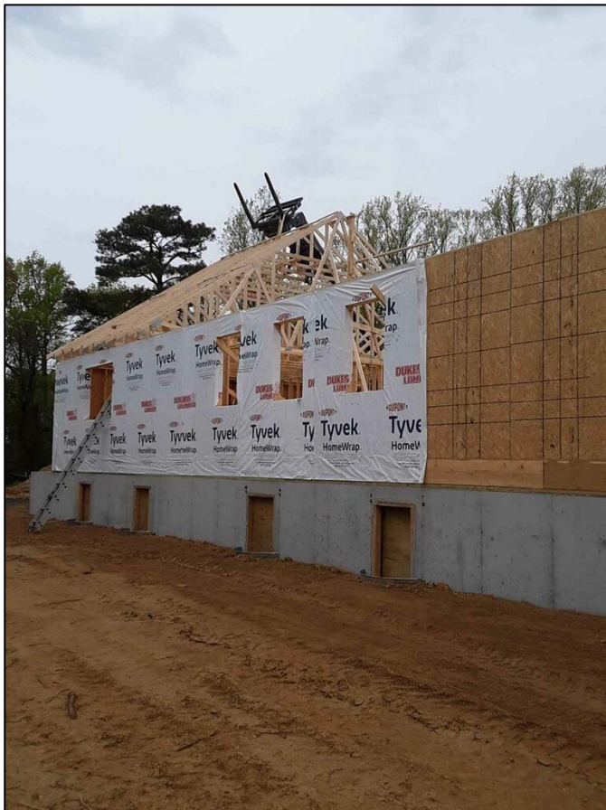
Construction on the new SJC building continues to move along. A look at the expansion project with photos taken on April 23.